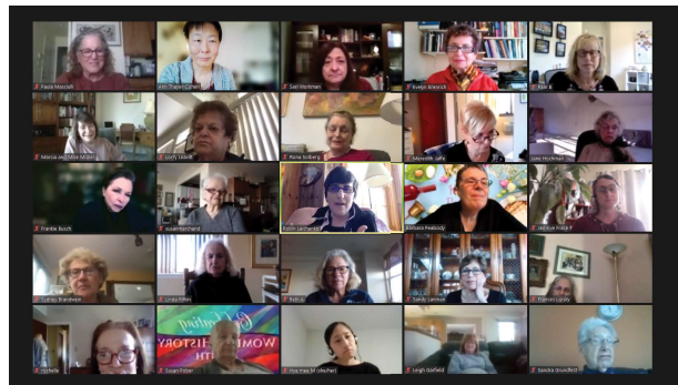
WGS Seder Program