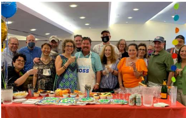
26,000 sandwiches for Elijah's Promise & counting

Contact Jay Goldberg by email at jgold@aol.com , or 848-482-6300 for information, or to sign up to pack lunches.