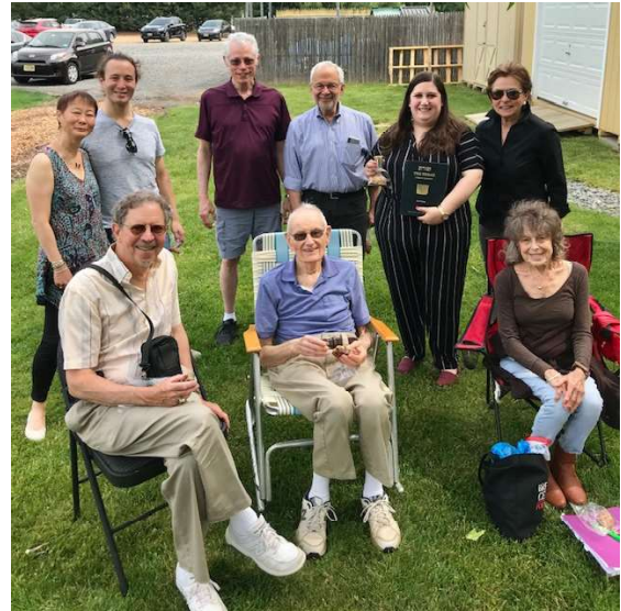
Torah Study at Eagle's Landing

Anshe Emeth clergy and staff will lead a Facebook Live Shabbat experience for our little ones. Tune in for activities, stories, songs and crafts, to celebrate our tradition's day of joy and rest.